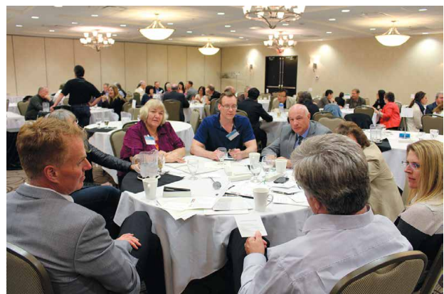
Participants at the Conference for Academics.