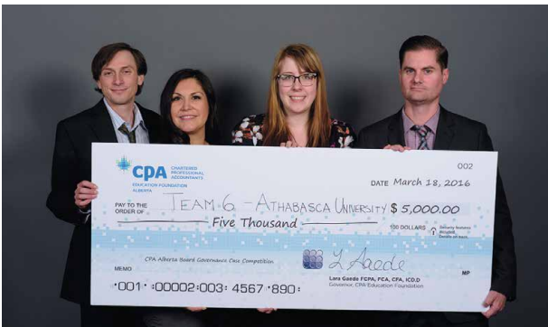
Students from Athabasca University take home second prize.