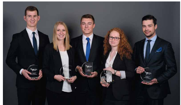
Students from Mount Royal University take home first prize.