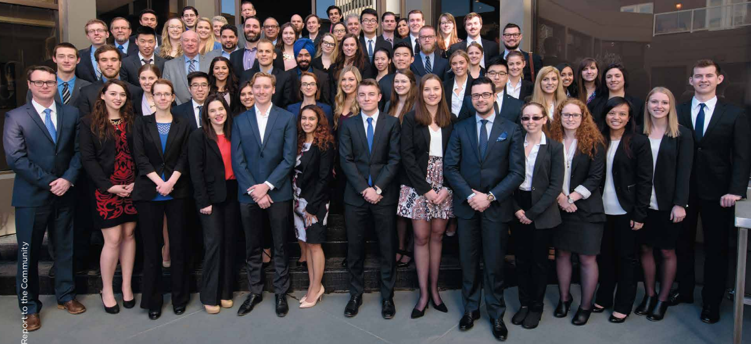
The 2016 case competition participants.