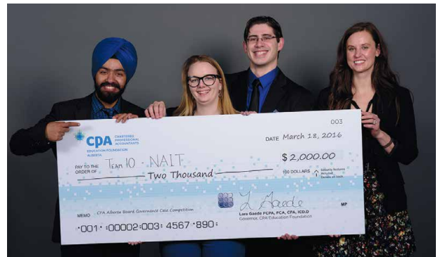
Students from NAIT take home third prize.